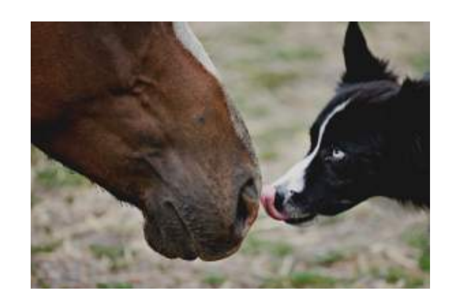
GET TO KNOW

We look forward to meeting you by phone or preferably in person!