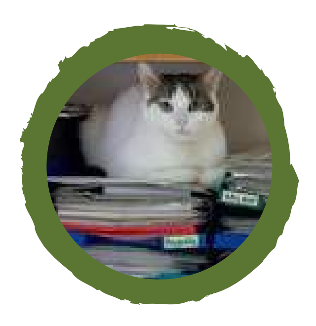
Mau-Mau Silent Observer